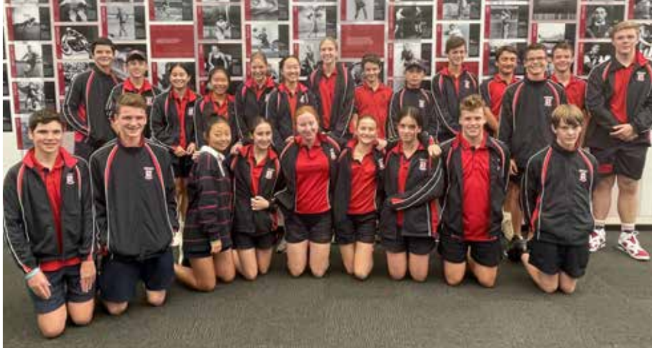
The Northholm Science and Engineering Competition team.