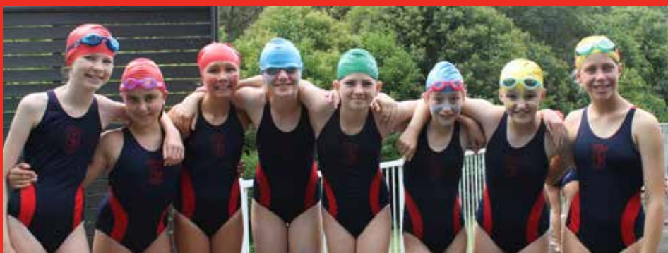
Amazing results in the pool at the Inter-House Swimming Carnival