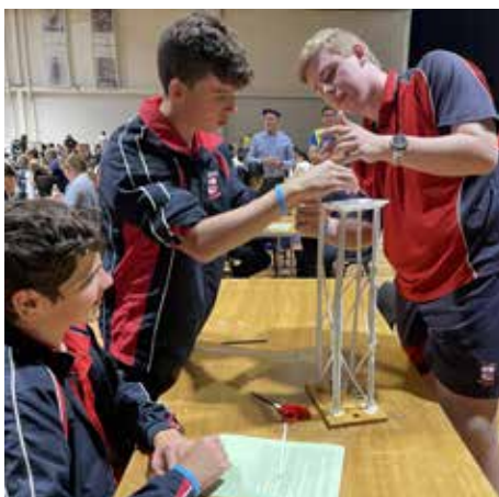
Opposite and above. Northholm students competing in a range of challenges at the Science and Engineering Competition.