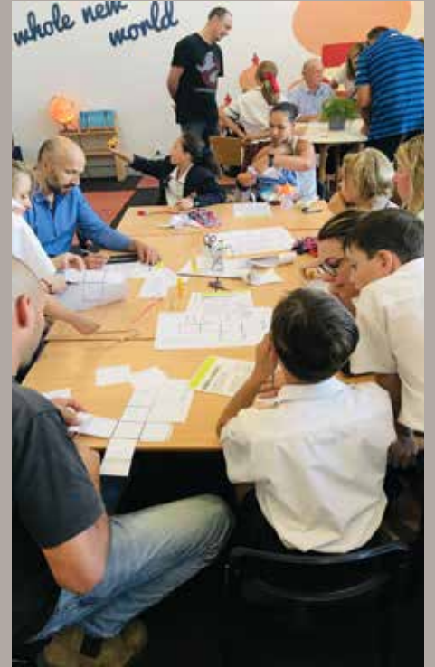
Above and right. Kindergarten, Year 1 and Year 2 students and their families at 'Sharing our Learning'.