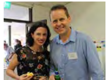
Above left. The Three Wise Men bringing gifts at Carols Night; Above. Parents and Carers enjoying the Annual Cocktail Evening; Left. Primary Years Carols Night.