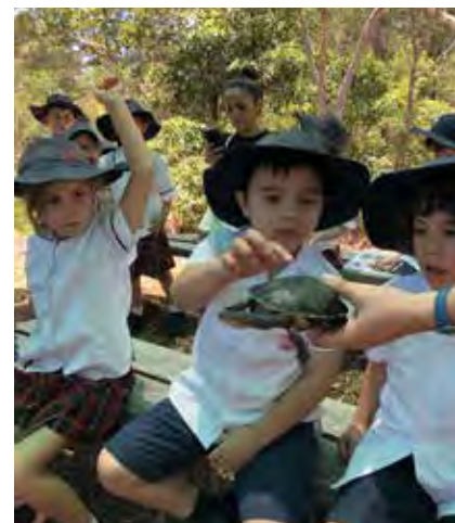
Right. Kindergarten students at Ku-ring-gai Wildflower Garden; Below. Year 8s participating in the Cook4Good Program.