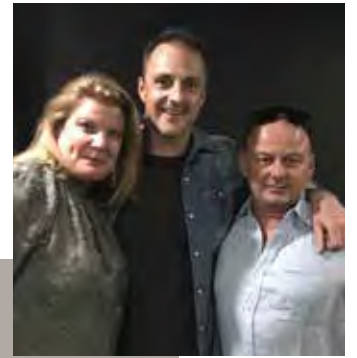
Celebrating the 25 Year Reunion of the class of 1994.

30 years following their graduation, the class of 1989 gathered in September at The Oaks at Neutral Bay to catchup and celebrate the years in a very special night. Students from 1994 got together at The Bella Vista Hotel in November to also relive high school days and connect with old school friends.